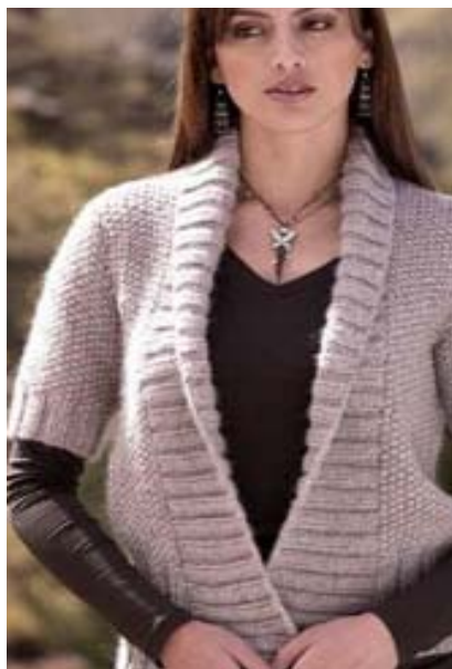
A design in Sulka