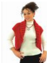
Diamond pattern 1148

Diamond has a lovely multi-coloured sock yarn called Foot Loose which has sold very well and is well priced, we have ordered more of that, plus more of the lovely soft Baby Alpaca Sport, very popular pattern shown next column.